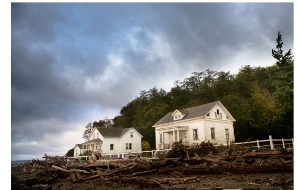
Point Robinson Light Station

Island residents receive a 15% discount during low season